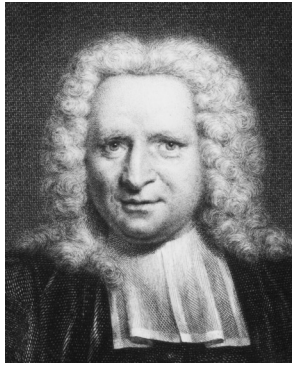
Pieter van Musschenbroek

produced a high voltage alright but, as soon as this voltage was applied to the human body it collapsed to a harmless level.