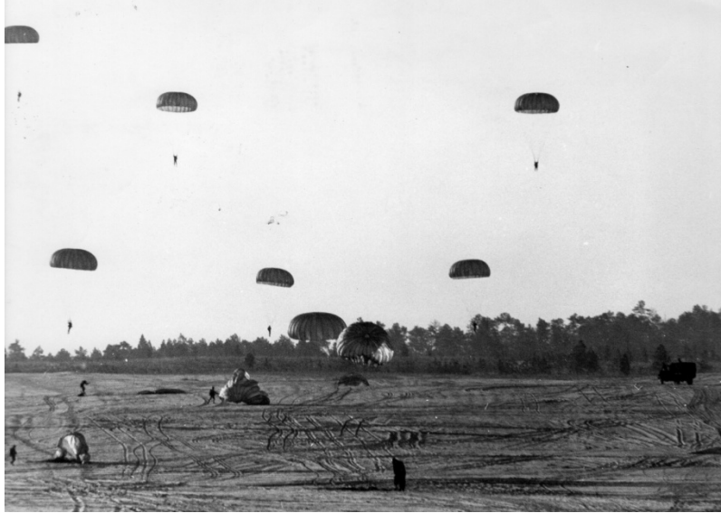
Special Forces medical class 67-1, Fort Bragg NC