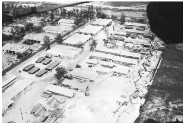
Aerial View of SOG base FOB 1 (note zig zag trench lines)

Major Snell was delighted with my choice and assigned me to ST Idaho under the command of SFC (Sergeant First Class) Glen Lane. In the following days and weeks, I would get to know the men on ST (Spike Team) Idaho during both training and leisure time.