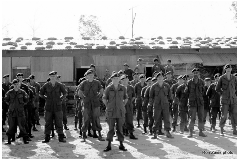
Men of FOB 1 standing tall