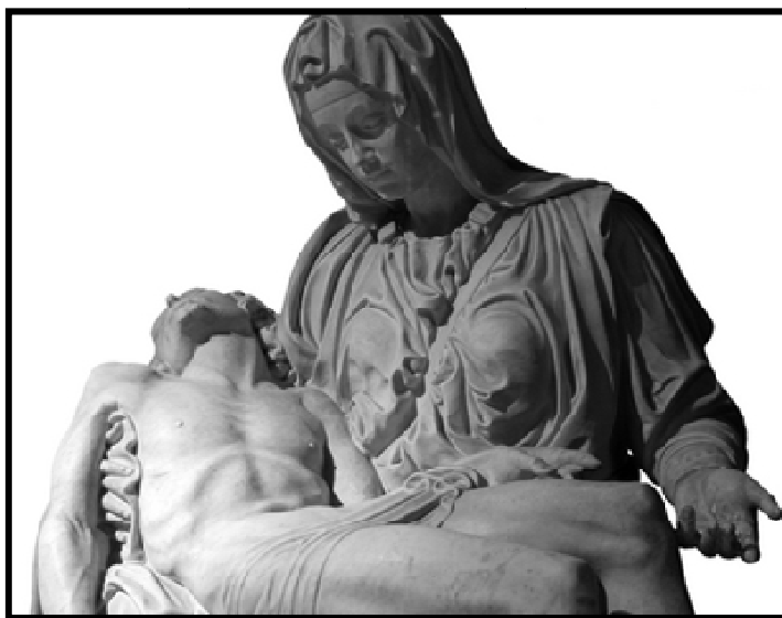
Michelangelo's Pieta in St. Peter's Basilica, Vatican City

Mary, Queen of Peace, we entrust our lives to you. Shelter us from war, hatred and oppression. Teach us to live in peace, to educate ourselves for peace. Inspire us to act justly, to revere all God has made. Root peace firmly in our hearts and in our world. Amen.