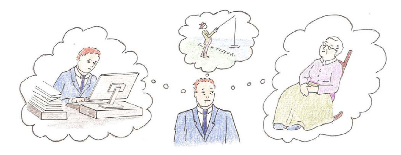
I am so stressed!

Stress can affect your mental, emotional, and physical health. Headaches, depression, anxiety, high-blood pressure, and disturbed sleep are signs of severe stress. Relaxation can reduce the effects of stress and give your body a chance to recover.