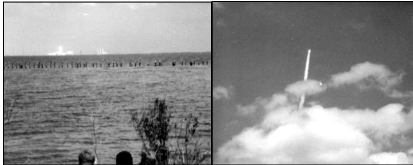
Moment of liftoff