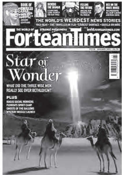
False theories on the Star of Bethlehem