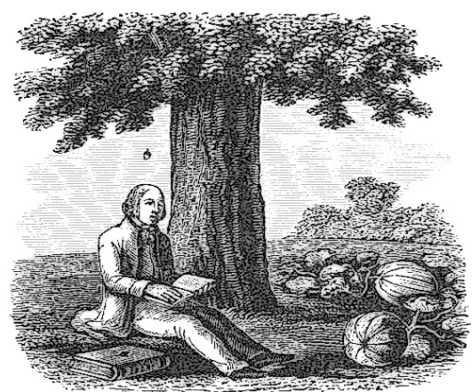
Man thinks himself wise until God shows him his folly