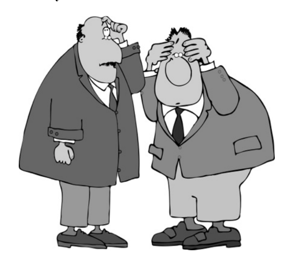
Written by Gary Gazlay

501 meaningless answers to 501 meaningless questions about meaningless things that don't make any sense at all and who in the world cares?