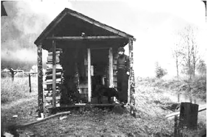
George standing in front of the cabin he lived in for a winter

It is a simple room—small but comprising all a man would need. I wonder why some people have such big and fancy houses? With so many switches?