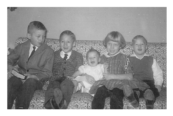
My siblings and I dressed for church.

Please note that this book is not about how to become more religious or how to become a better church member. Those are worthy goals, which have their place, to be sure. But here, I want to discuss something that I consider to be far more important. It's one thing to be religious, but it's quite another to be spiritual. Wouldn't you agree? What this book offers is a simple plan for becoming a more spiritual person, one who enjoys a growing connection with the supreme being of the universe.