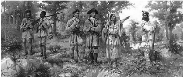
Figure 7: Lewis and Clark's Corps of Discovery at Three Forks

The object of your mission is to explore the Missouri River, & such principle stream of it, as, by it's [sic] course & communication with the waters of the Pacific ocean, may offer the most direct & practicable water communication across this continent, for the purpose of commerce.