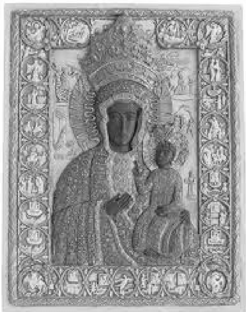
One of the Many Black Modonnas