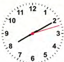
Name in vain