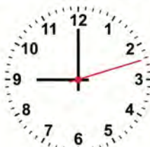
Do not steal