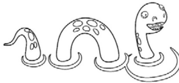
63. Loch Ness Monster

However, we can determine its position and momentum based on a few particle fragments. It's rather simple, really. This complicated explanation can be translated into elementary language, even a 2 nd grader could understand. Let's connect the dots! Back in Montana while at the Bozeman Public Library, I found a rather simple explanation. I wish I could remember who explained it this way so I can give them credit (fyi, I wish I could remember everyone who had shared their knowledge and given me things to remember so I can give them all credit by name. Many thanks to all ya'll). In regard to Heisenberg's Uncertainty Principle the following explains this seemingly complicated science into a simple explanation. It is made easy to understand by looking at this illustration of the Loch Ness Monster surfacing from the deep lake, see figure 63.