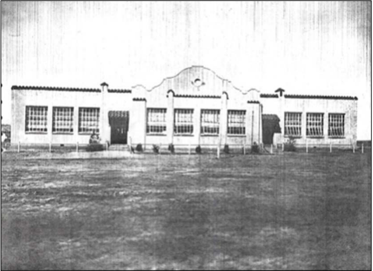
City View School Circa. 1954