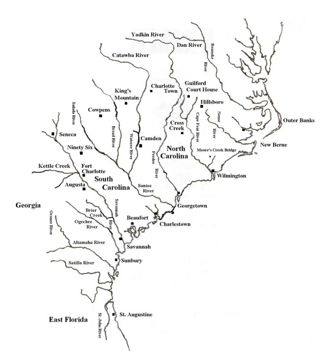
The Carolinas and Georgia