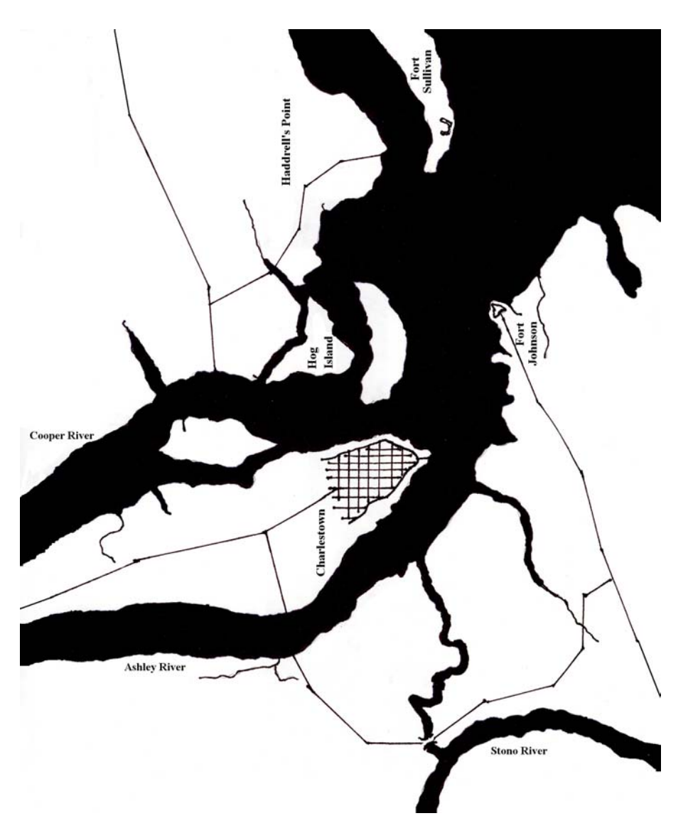
Charlestown, South Carolina