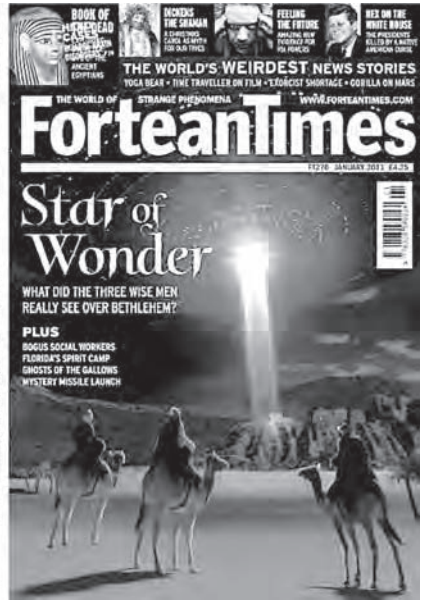
False theories on the Star of Bethlehem