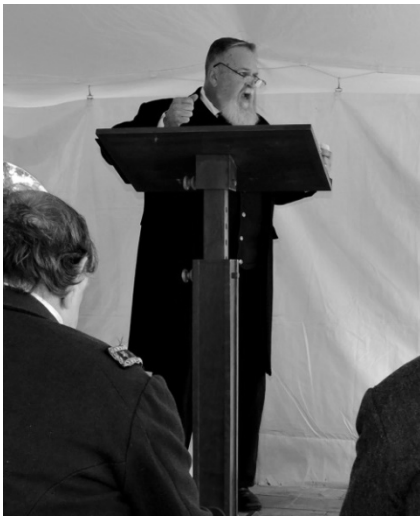
Circuit preachers delivered sermons in various locations (author photograph, 2016 Jackson Civil War Muster).