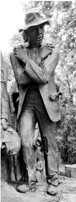
A figure from The Underground Railroad Sculpture in Battle Creek, Mich.