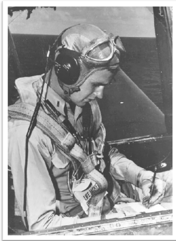
U.S. Navy Pilot George Bush in the cockpit of an Avenger (1942-1945)