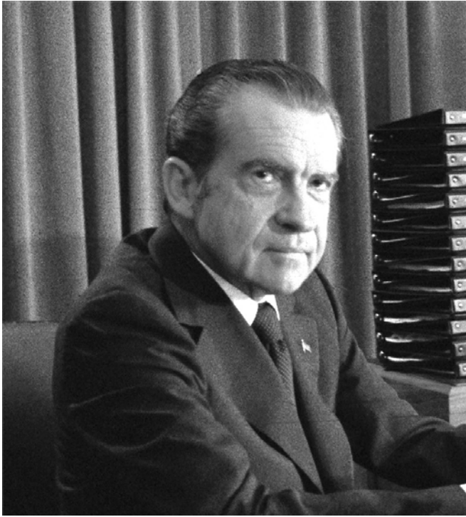
Richard M. Nixon circa 1987