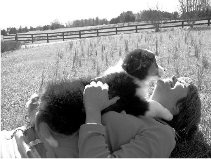
Tigger and The Storyteller as a puppy