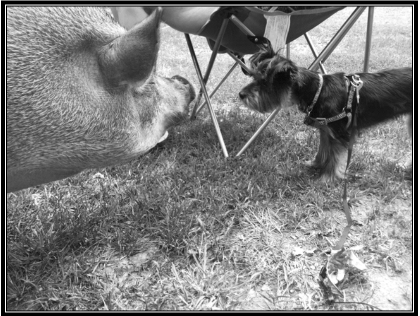
Showdown! Our family dog Marley comes face to face to with our pet hog Olive.