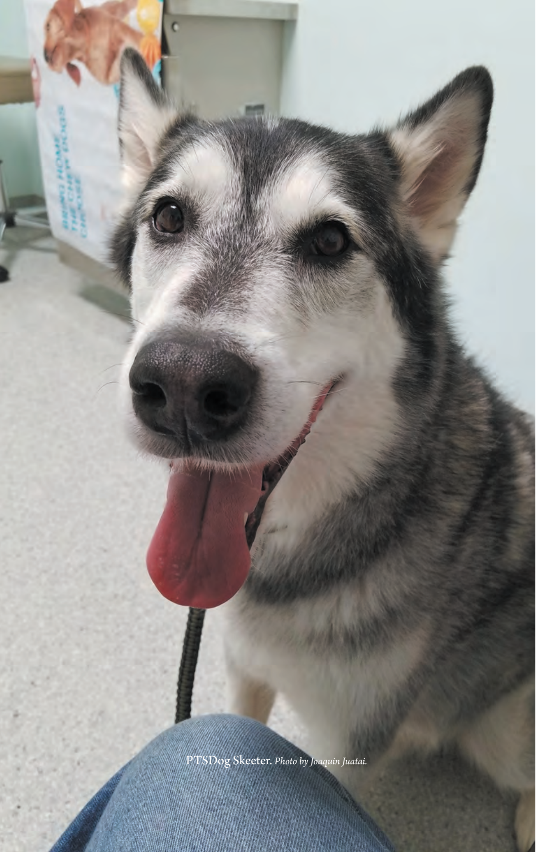
PTSDog Skeeter.